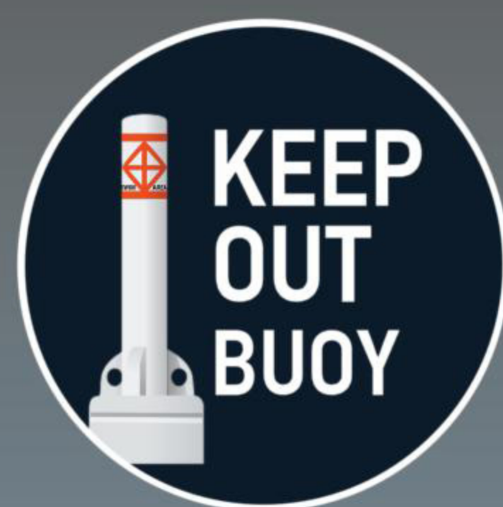
KEEP OUT BUOY