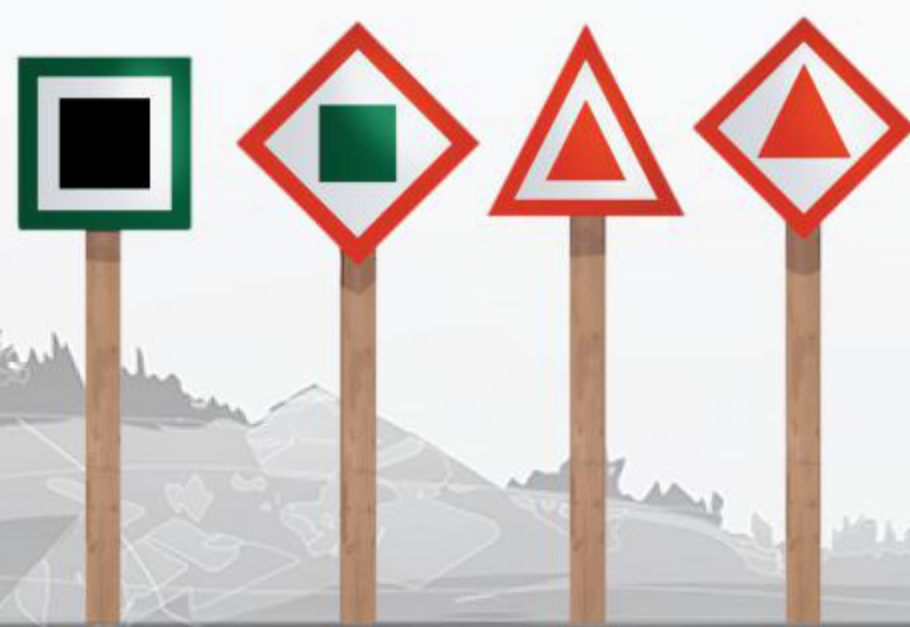
DAY BEACONS MARK CHANNELS OR HAZZARDS

BIFURCATION BUOY MARK THE SAFEST ROUTE AT THE JUNCTION OF